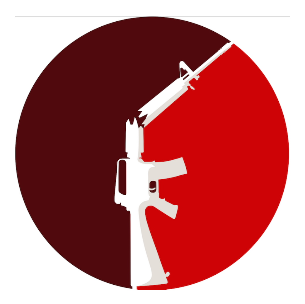
"Live' demonstrations" available upon request.

http://www.asiandefense.com/CONTACT-US/World-Wide-Agents, as well as arms fair sales agents in the back of its 2017 prospectus. Why worry about North Korea when we have such sterling defenders!